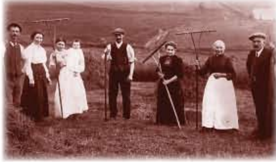
Torri gwair yng Nghwmystwyth, tua 1900 Haymaking in Cwmystwyth, c.1900

The church has formed an important part of the community and landscape of Hafod Estate and Cwmystwyth for nearly 400 years. Here you will find the graves of squires, lead miners, farmers, shepherds, shopkeepers, craftsmen and estate workers; people who all played their part in building the local community and whose contribution is treasured by those who live here today.