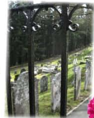
Y fynwent The cemetery